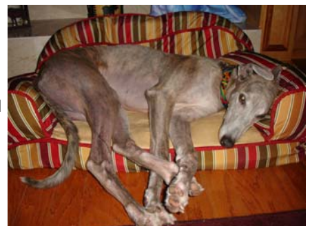
Does this couch make me look fat?

If you find that your Greyhound needs to lose a bit of weight, make sure to take it very slowly. Cutting down their kibble portion by a quarter of a cup each meal will help them to gradually get back to an ideal weight. Exercise is also a great way to get your Greyhound trim and fit, so why add a leisurely walk to your schedule weather permitting?