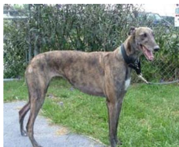
Whistler's Donna aka Donna

After several months in a foster home together, they were adopted by a very nice family. Unfortunately, this family's circumstances changed, and the girls again found themselves back at GPA. They are back in the same foster home they were previously in.